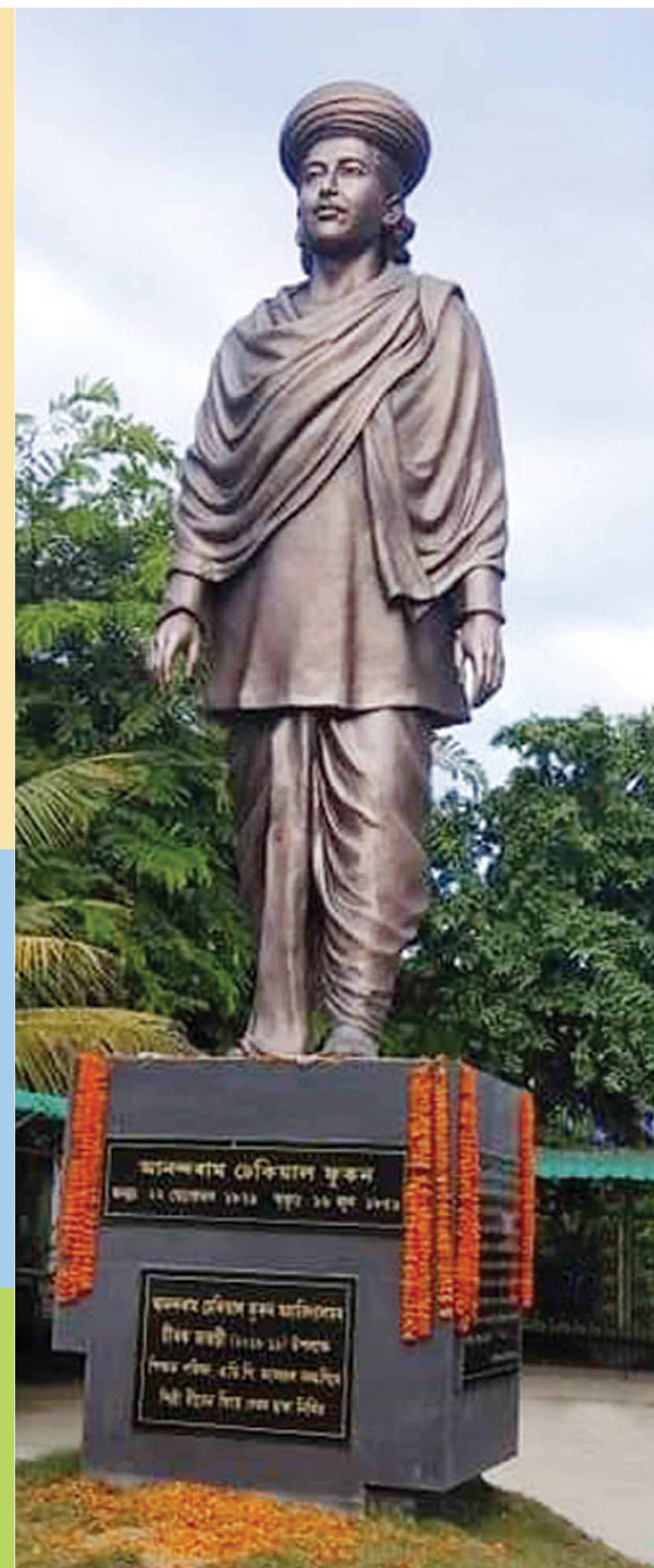
Newly constructed statue of Anandaram Dhekial Phookan with the contribution of the members of Teachers Council of the college.